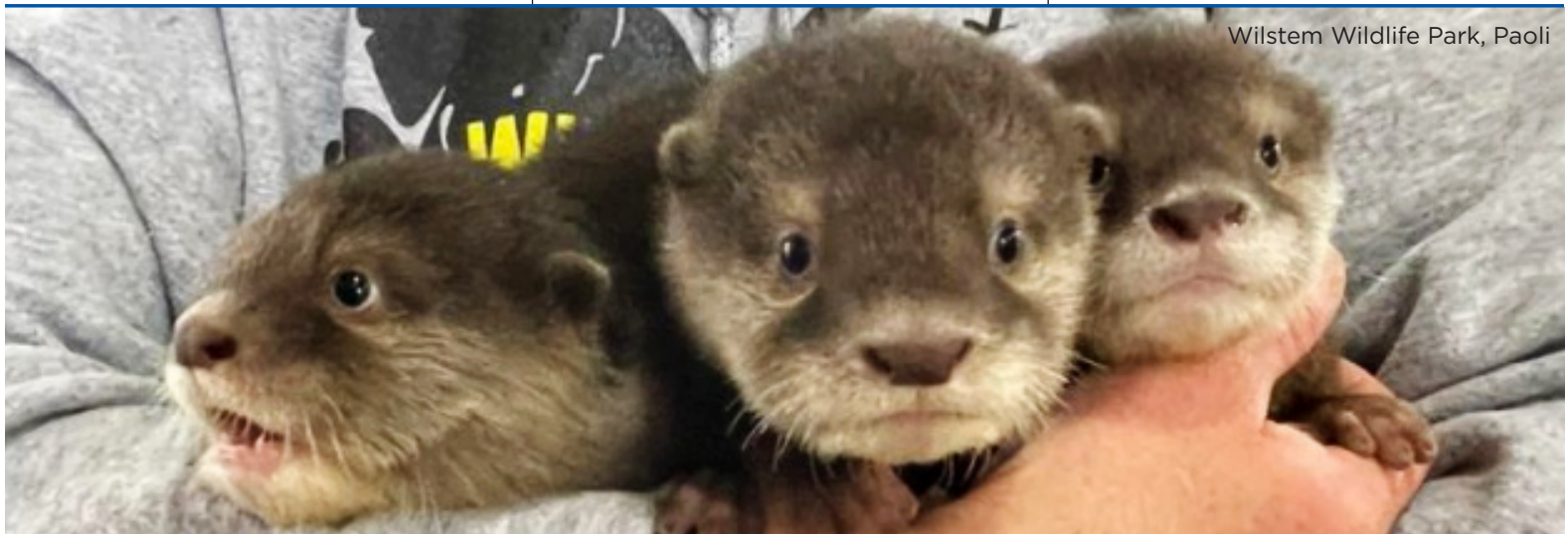
Wilstem Wildlife Park, Paoli