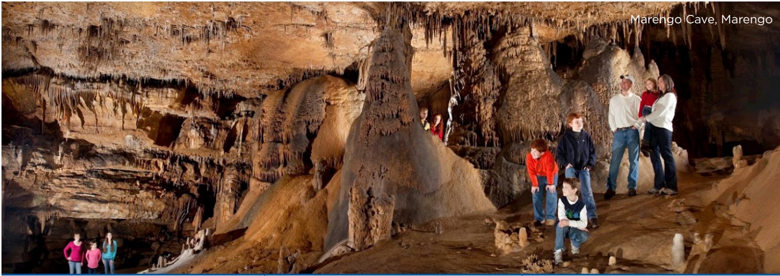
Marengo Cave, Marengo