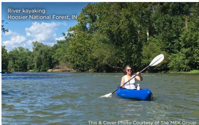
River kayaking Hoosier National Forest, IN