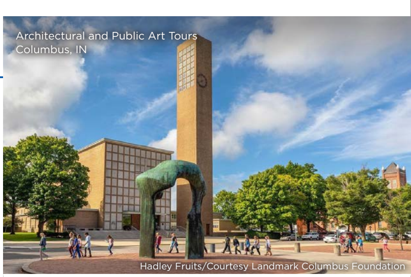
Architectural and Public Art Tours Columbus, IN

Southern Indiana Community Health Care 420 West Longest Street PO Box 270 • Paoli, Indiana 47454 SICHC.ORG/teamSICHC