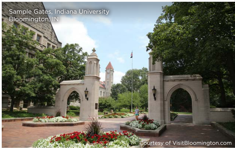
Sample Gates, Indiana University Bloomington, IN